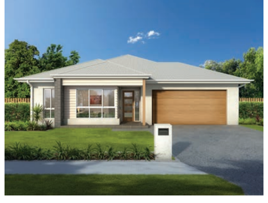
Sydney 255 - Coastal Façade