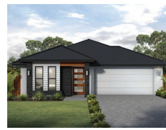
Juno 187 - Coastal Façade

Have piece of mind with a 6 Year Structural Guarantee.