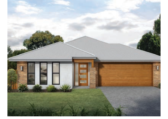
Indie 209 - Traditional Façade