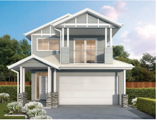
Zarie 215 - Heritage Façade