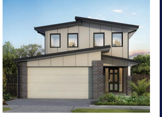
Daydream 181 - Coastal Façade