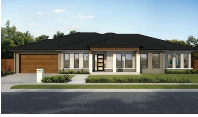
Oxley 288 - Coastal Façade