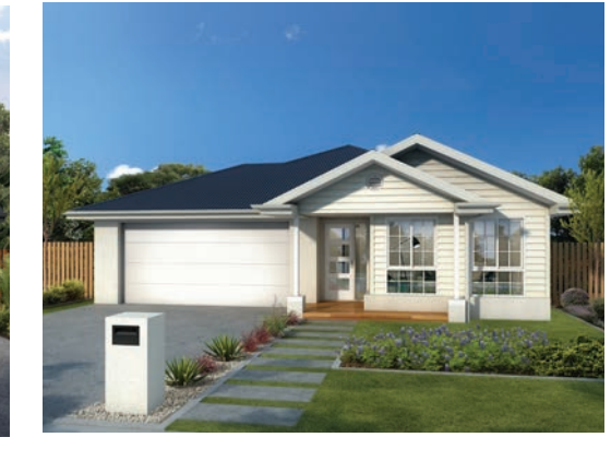
Ellis 191 - Heritage Façade