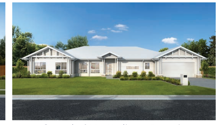
Georgia 311 - Heritage Façade

UNLOCK YOUR DREAM HOME WITH SOME OF OUR FAVOURITE FAÇADES