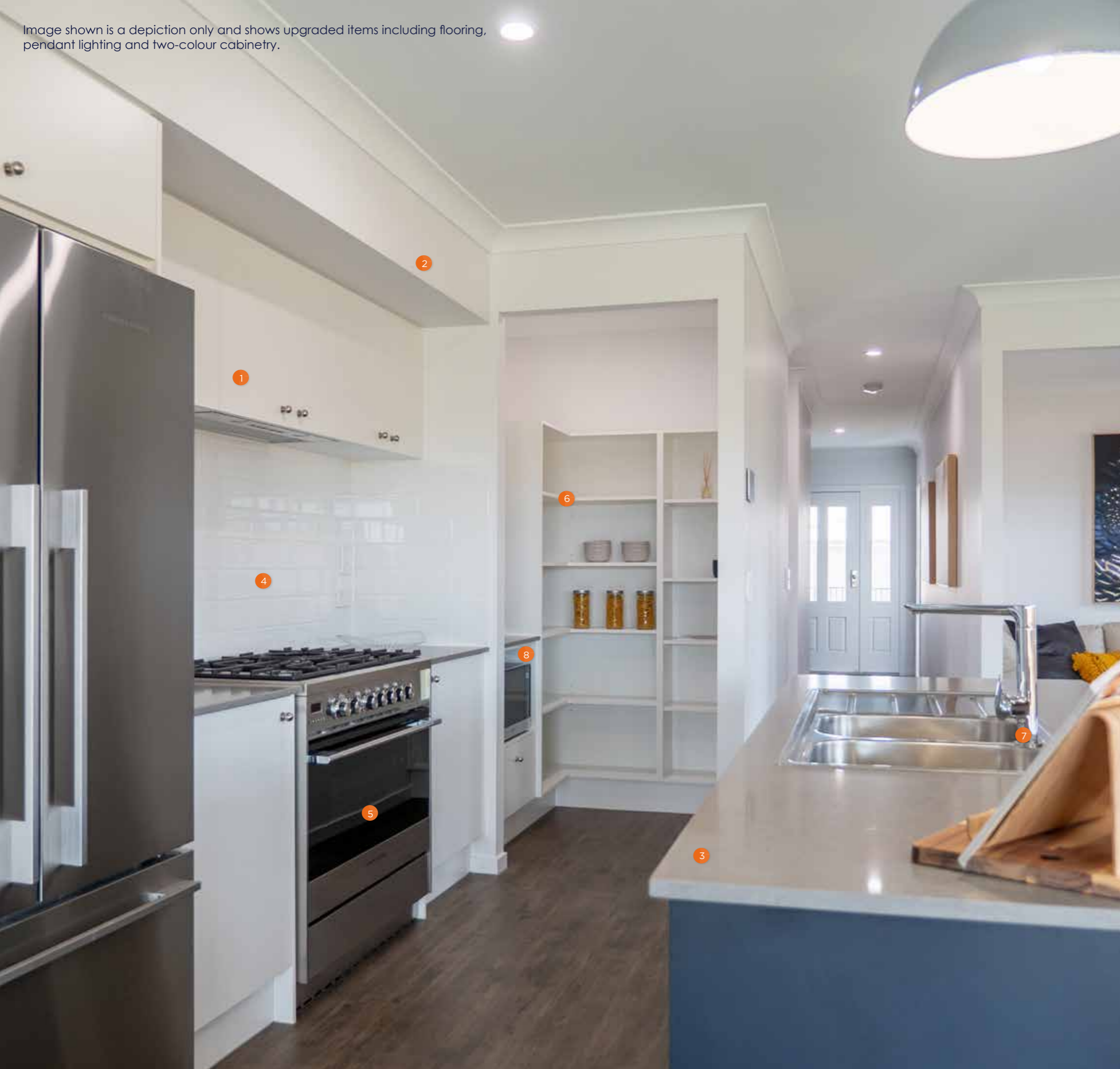
Image shown is a depiction only and shows upgraded items including flooring, pendant lighting and two-colour cabinetry.