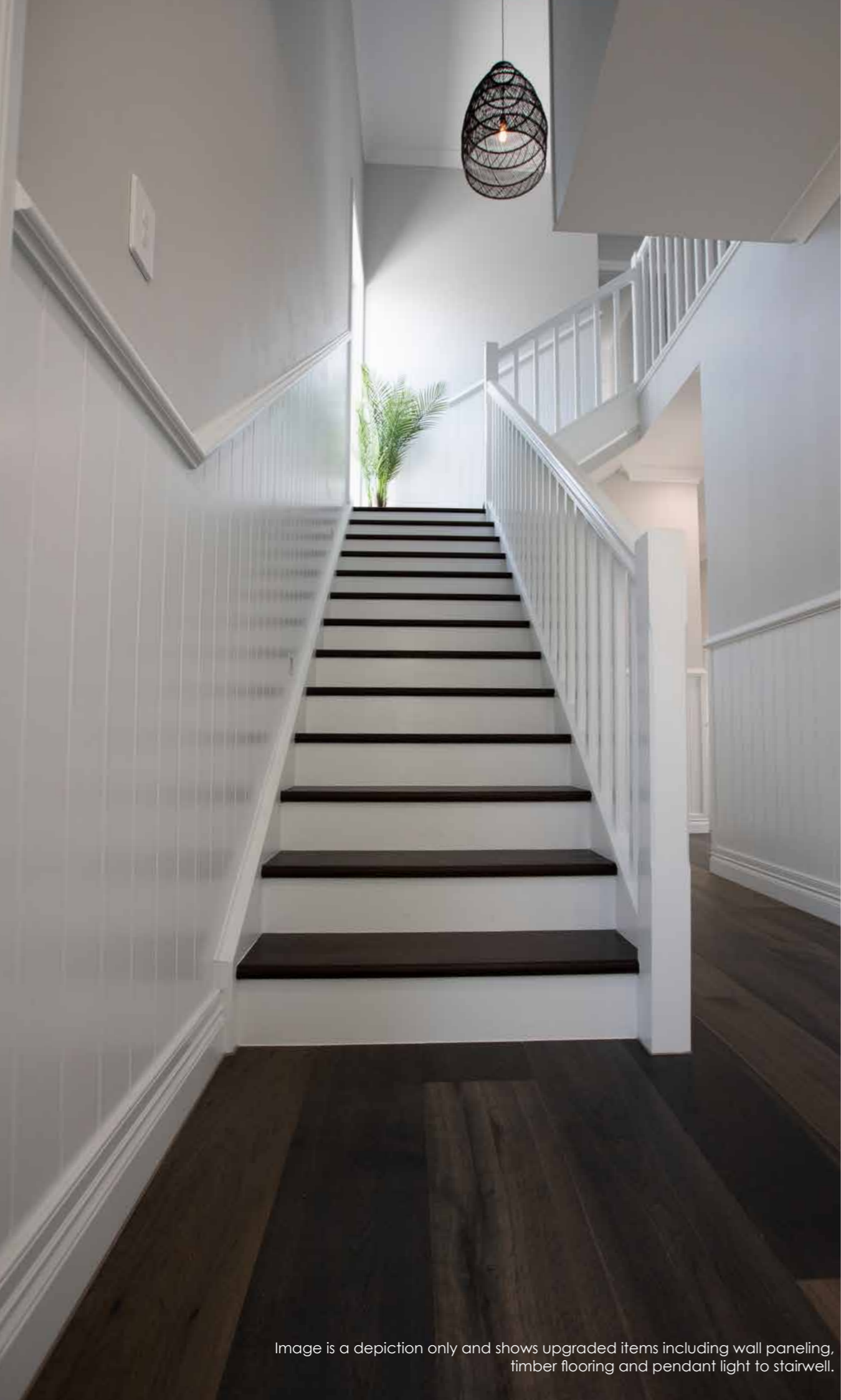
Image is a depiction only and shows upgraded items including wall paneling, timber flooring and pendant light to stairwell.