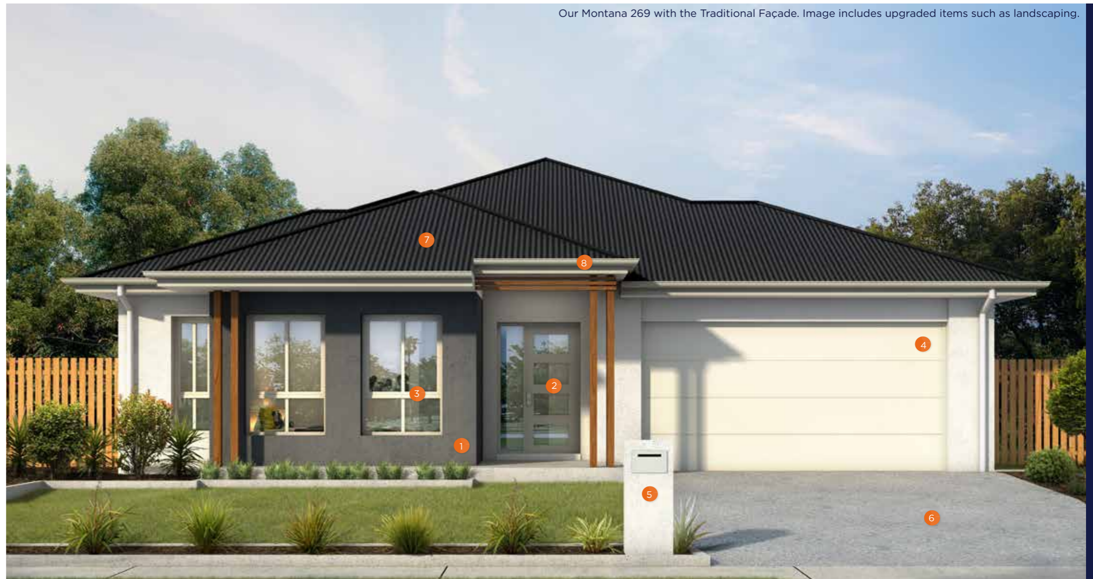
Our Montana 269 with the Traditional Façade. Image includes upgraded items such as landscaping.